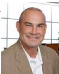
2017 Membership Chair