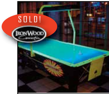
DYNAMO HOT FLASH BACK-LIT AIR HOCKEY