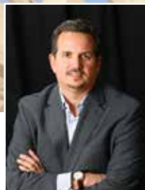
2017 Custom Builders Council Chair