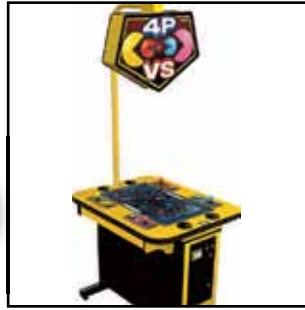
PAC-MAN BATTLE ROYALE