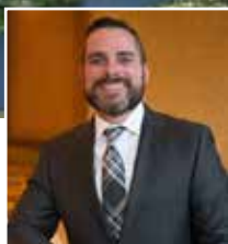
2017 Remodelers Council President