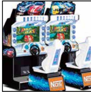
DEAD HEAT RACING GAME