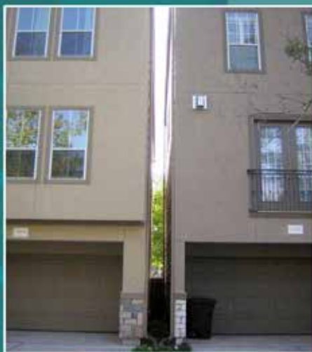
FIRE RATED GLASS BLOCK