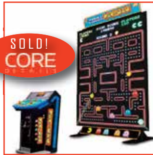
WORLD'S LARGEST PAC-MAN GAME