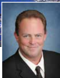
2017 Bay Area Division Chair