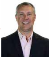
2017 Sales & Marketing Council President