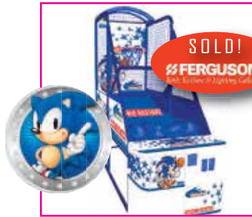
SONIC ALLSTARS BASKETBALL

HURRY, THESE FANTASTIC SPONSORSHIP OPPORTUNITIES WILL SELL FAST!