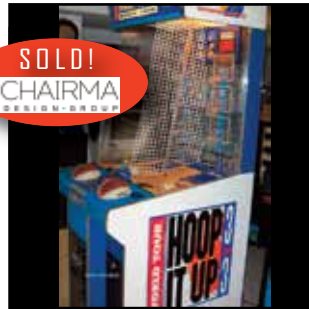
HOOP IT UP BASKETBALL