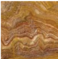
Terracotta Onyx slab from Arizona Tile.

For showroom locations and a look at our complete collection, visit www.arizonatile.com .