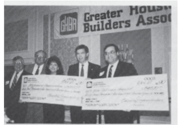
Replicas of the checks presented to the two charities at the Gala.

Ten year anniversary. With over 150 donors, more than any other year, the Project raised $129,340 for the Alzheimer's Association and Texas Children's. In addition to a fellowship, funds provided from the 1990 Project were used to construct a support area, or "mission control," for the children's mobile care unit.