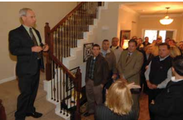
▲ PHOTO TOP: Chesmar staff attends ground breaking ceremony for Chesmar Homes' first Benefit Home. The home was constructed in the Canyon Gate community of Sterling Lakes.