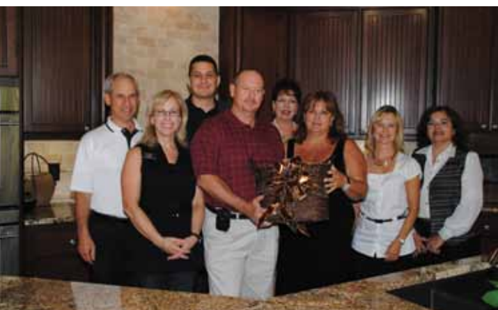
► PHOTO BOTTOM: Don visits with Village Builders Benefit Home buyers and Village staff at the recent closing of their home at the Design Center.